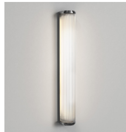
Code: 1380114 Finish: Polished Chrome Efficacy: 51 lm/w

To maintain this product to its best condition, please view our care and cleaning guide on the support section of the astro website.