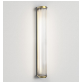
Code: 1380104 Finish: Matt Gold Efficacy: 45 lm/w