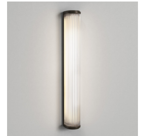
Code: 1380105 Finish: Bronze Efficacy: 51 lm/w