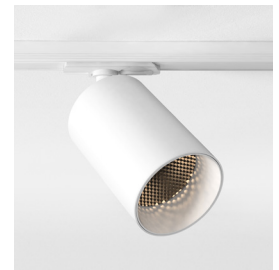
Code: 1396058 Finish: Matt White Lumens: 945 lm

To maintain this product to its best condition, please view our care and cleaning guide on the support section of the astro website.