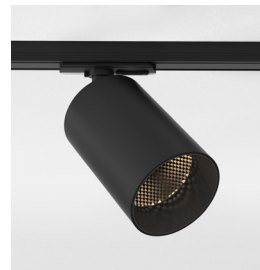
Code: 1396055 Finish: Matt Black Lumens: 892 lm