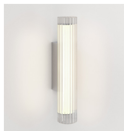
Code: 1409070 Finish: Polished Chrome