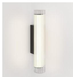
Code: 1409073 Finish: Matt Black

To maintain this product to its best condition, please view our care and cleaning guide on the support section of the astro website.