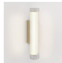
Code: 1409072 Finish: Matt Gold