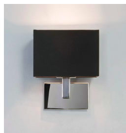
CODE: 1099003 (0567) FINISH: POLISHED CHROME