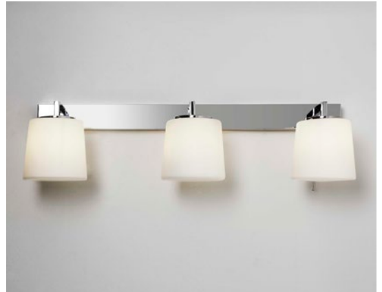
CODE: 1304001 FINISH: POLISHED CHROME

TO MAINTAIN THIS PRODUCT TO ITS BEST CONDITION, PLEASE VIEW OUR CARE AND CLEANING GUIDE ON THE SUPPORT SECTION OF THE ASTRO WEBSITE.