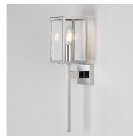
CODE: 1369004 (8191) FINISH: POLISHED NICKEL

THIS PRODUCT IS NOT SUITABLE FOR INSTALLATION WITHIN FIVE MILES OF THE COAST. FOR THESE ENVIRONMENTS, PLEASE FILTER PRODUCTS ON THE ASTRO WEBSITE BY 'COASTAL'.