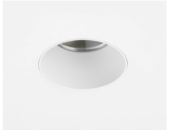
CODE: 1392005 FINISH: MATT WHITE

TO MAINTAIN THIS PRODUCT TO ITS BEST CONDITION, PLEASE VIEW OUR CARE AND CLEANING GUIDE ON THE SUPPORT SECTION OF THE ASTRO WEBSITE.