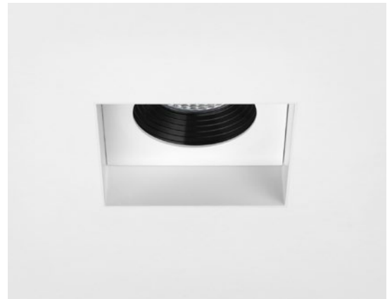
CODE: 1248012 FINISH: MATT WHITE

TO MAINTAIN THIS PRODUCT TO ITS BEST CONDITION, PLEASE VIEW OUR CARE AND CLEANING GUIDE ON THE SUPPORT SECTION OF THE ASTRO WEBSITE.