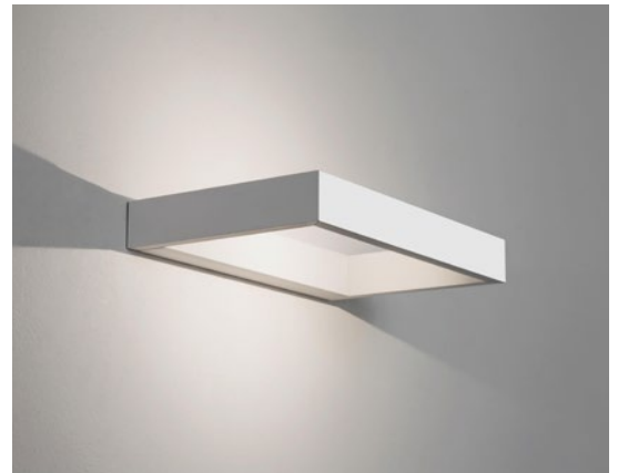
CODE: 1208001 FINISH: MATT WHITE

TO MAINTAIN THIS PRODUCT TO ITS BEST CONDITION, PLEASE VIEW OUR CARE AND CLEANING GUIDE ON THE SUPPORT SECTION OF THE ASTRO WEBSITE.