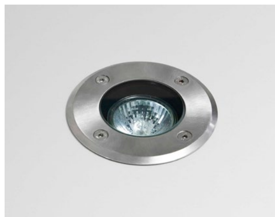
CODE: 1312001 FINISH: BRUSHED STAINLESS STEEL

TO MAINTAIN THIS PRODUCT TO ITS BEST CONDITION, PLEASE VIEW OUR CARE AND CLEANING GUIDE ON THE SUPPORT SECTION OF THE ASTRO WEBSITE.