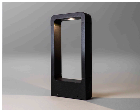
CODE: 1357005 FINISH: TEXTURED BLACK

TO MAINTAIN THIS PRODUCT TO ITS BEST CONDITION, PLEASE VIEW OUR CARE AND CLEANING GUIDE ON THE SUPPORT SECTION OF THE ASTRO WEBSITE.