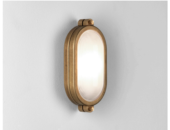
CODE: 1387002 FINISH: ANTIQUE BRASS

THIS PRODUCT IS SUITABLE FOR ONEROUS ENVIRONMENTS AND CAN BE INSTALLED WITHIN FIVE MILES OF THE COAST - THREE YEAR WARRANTY APPLIES.