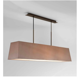
CODE: 1320002 FINISH: BRONZE

TO MAINTAIN THIS PRODUCT TO ITS BEST CONDITION, PLEASE VIEW OUR CARE AND CLEANING GUIDE ON THE SUPPORT SECTION OF THE ASTRO WEBSITE.