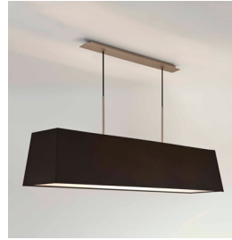
CODE: 1320001 FINISH: MATT NICKEL