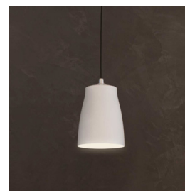
CODE: 1224018 FINISH: MATT WHITE