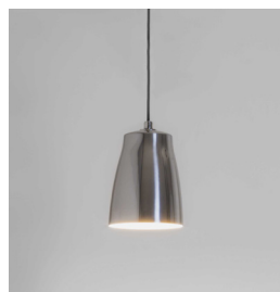
CODE: 1224017 FINISH: POLISHED ALUMINIUM