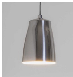
CODE: 1224020 FINISH: POLISHED ALUMINIUM