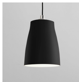
CODE: 1224022 FINISH: MATT BLACK

TO MAINTAIN THIS PRODUCT TO ITS BEST CONDITION, PLEASE VIEW OUR CARE AND CLEANING GUIDE ON THE SUPPORT SECTION OF THE ASTRO WEBSITE.