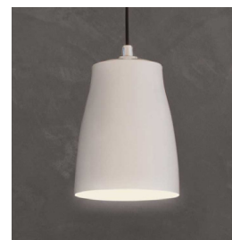
CODE: 1224021 FINISH: MATT WHITE