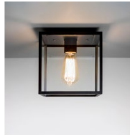
CODE: 1354001 FINISH: TEXTURED BLACK