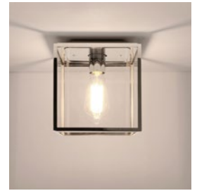
CODE: 1354002 FINISH: POLISHED NICKEL

TO MAINTAIN THIS PRODUCT TO ITS BEST CONDITION, PLEASE VIEW OUR CARE AND CLEANING GUIDE ON THE SUPPORT SECTION OF THE ASTRO WEBSITE.