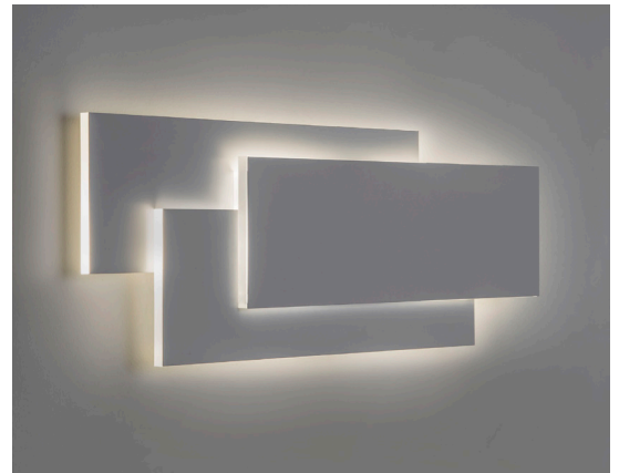
CODE: 1352001 FINISH: MATT WHITE

TO MAINTAIN THIS PRODUCT TO ITS BEST CONDITION, PLEASE VIEW OUR CARE AND CLEANING GUIDE ON THE SUPPORT SECTION OF THE ASTRO WEBSITE.