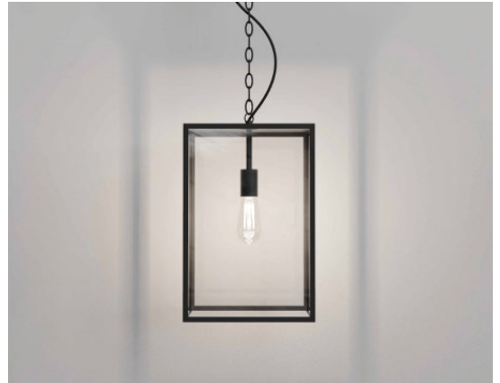
CODE: 1095033 FINISH: TEXTURED BLACK

TO MAINTAIN THIS PRODUCT TO ITS BEST CONDITION, PLEASE VIEW OUR CARE AND CLEANING GUIDE ON THE SUPPORT SECTION OF THE ASTRO WEBSITE.