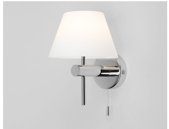
CODE: 1050002 FINISH: POLISHED CHROME