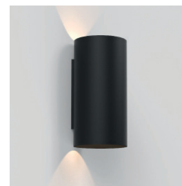
CODE: 1399010 FINISH: TEXTURED BLACK LUMENS: 668lm