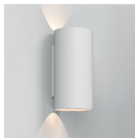
CODE: 1399009 FINISH: TEXTURED WHITE LUMENS: 892lm