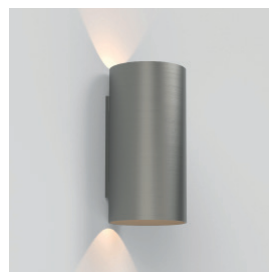
CODE: 1399011 FINISH: MATT NICKEL LUMENS: 892lm