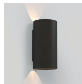
CODE: 1399012 FINISH: BRONZE LUMENS: 668lm

TO MAINTAIN THIS PRODUCT TO ITS BEST CONDITION, PLEASE VIEW OUR CARE AND CLEANING GUIDE ON THE SUPPORT SECTION OF THE ASTRO WEBSITE.