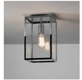
CODE: 1095022 FINISH: POLISHED NICKEL

THIS PRODUCT IS NOT SUITABLE FOR INSTALLATION WITHIN FIVE MILES OF THE COAST. FOR THESE ENVIRONMENTS, PLEASE FILTER PRODUCTS ON THE ASTRO WEBSITE BY 'COASTAL'.