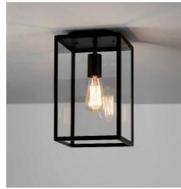
CODE: 1095021 FINISH: TEXTURED BLACK