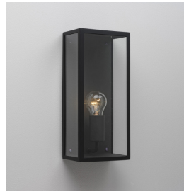
CODE: 1183001 FINISH: TEXTURED BLACK