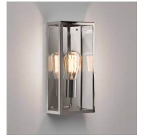
CODE: 1183008 FINISH: POLISHED NICKEL

THIS PRODUCT IS NOT SUITABLE FOR INSTALLATION WITHIN FIVE MILES OF THE COAST. FOR THESE ENVIRONMENTS, PLEASE FILTER PRODUCTS ON THE ASTRO WEBSITE BY 'COASTAL'.