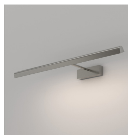
CODE: 1371015 FINISH: MATT NICKEL