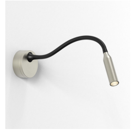
CODE: 1435006 FINISH: MATT NICKEL