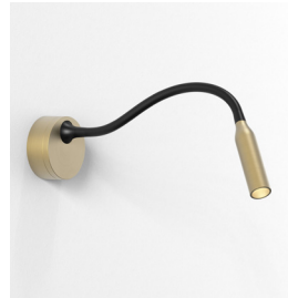
CODE: 1435007 FINISH: MATT GOLD