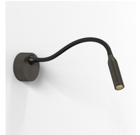
CODE: 1435008 FINISH: BRONZE

TO MAINTAIN THIS PRODUCT TO ITS BEST CONDITION, PLEASE VIEW OUR CARE AND CLEANING GUIDE ON THE SUPPORT SECTION OF THE ASTRO WEBSITE.