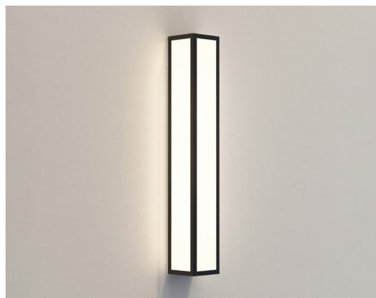
CODE: 1178011 FINISH: TEXTURED BLACK

Suitable for use within five miles (eight km) of the coast or in other onerous environments. Subject to a three-year warranty, for further information please view our website.