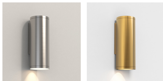
Code: 1428002 Code: 1428020 Finish: Brushed Stainless Steel Finish: PVD Brushed Brass

Suitable for use within five miles (eight km) of the coast or in other onerous environments. Subject to a three-year warranty, for further information please view our website.