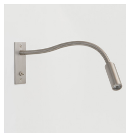
Code: 1295002 Finish: Matt Nickel