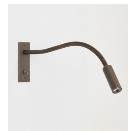
Code: 1295003 Finish: Bronze

To maintain this product to its best condition, please view our care and cleaning guide on the support section of the astro website.