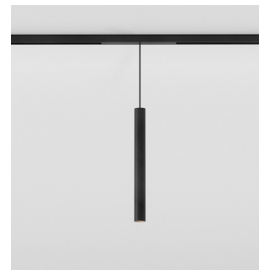
Code: 1396044 Finish: Matt Black Lumens: 630lm