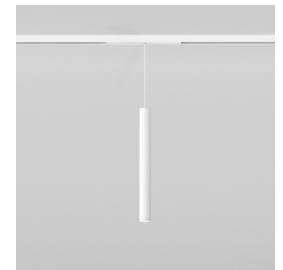
Code: 1396045 Finish: Matt White Lumens: 632lm

To maintain this product to its best condition, please view our care and cleaning guide on the support section of the astro website.