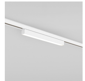
Code: 1521004 Finish: Matt White Lumens: 543lm Efficacy: 46lm/W

To maintain this product to its best condition, please view our care and cleaning guide on the support section of the astro website.