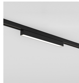
Code: 1521003 Finish: Matt Black Lumens: 466lm Efficacy: 39lm/W