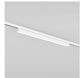
Code: 1521006 Finish: Matt White

To maintain this product to its best condition, please view our care and cleaning guide on the support section of the astro website.