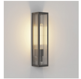
Code: 1402021 Finish: PVD Brushed Gunmetal

Suitable for use within five miles (eight km) of the coast or in other onerous environments. Subject to a ten-year warranty, for further information please view our website.