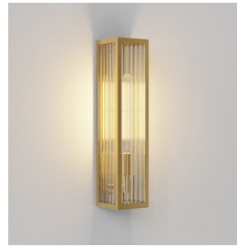
Code: 1402020 Finish: PVD Brushed Brass