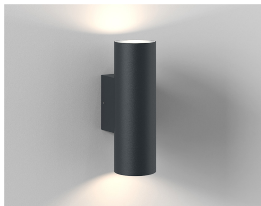
Code: 1516002 Finish: Anthracite

This product is not suitable for installation within five miles of the coast. For these environments, please filter products on the astro website by 'coastal'.