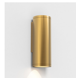
Code: 1428020 Finish: PVD Brushed Brass