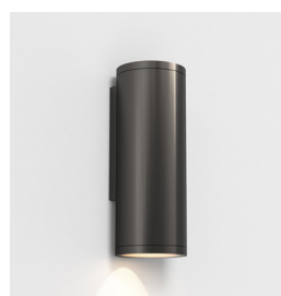
Code: 1428022 Finish: PVD Brushed Gunmetal

Suitable for use within five miles (eight km) of the coast or in other onerous environments. Subject to a ten-year warranty, for further information please view our website.