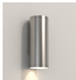
Code: 1428002 Finish: Brushed Stainless Steel