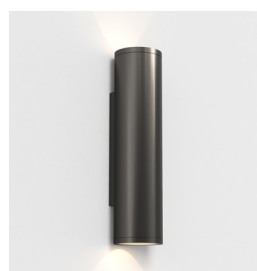
Code: 1428023 Finish: PVD Brushed Gunmetal

Suitable for use within five miles (eight km) of the coast or in other onerous environments. Subject to a ten-year warranty, for further information please view our website.