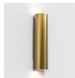
Code: 1428021 Finish: PVD Brushed Brass