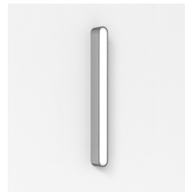
Code: 1440028 Finish: Polished Chrome