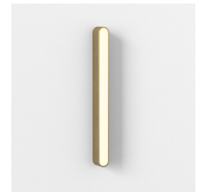
Code: 1440030 Finish: Matt Brushed Brass