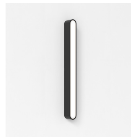
Code: 1440033 Finish: Matt Black

To maintain this product to its best condition, please view our care and cleaning guide on the support section of the astro website.