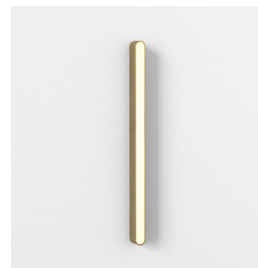
Code: 1440035 Finish: Matt Brushed Brass

To maintain this product to its best condition, please view our care and cleaning guide on the support section of the astro website.