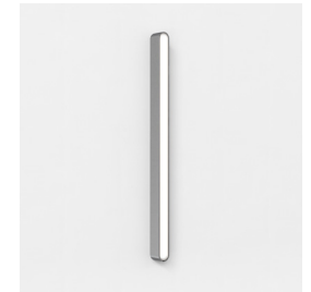
Code: 1440032 Finish: Polished Chrome