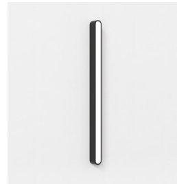
Code: 1440031 Finish: Matt Black